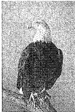
Lyndale Leaders ...